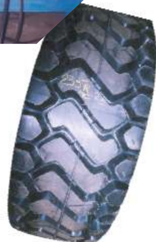
Moulded to perfection - The new 23.5R 25 tyre