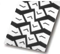
Z-Lug (Highway Special)