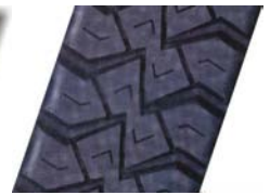
WHL 212 (Highway Special)