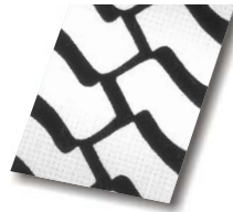
Lug Logger (Mining Special)

The treads which are expected to deliver mileage at par with new tyres are under the observations for the next three months after which the tread will be introduced to other markets as well.